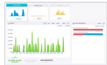
Cleaned Traffic Report