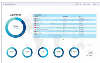
Network Status Summary