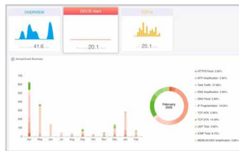
DDoS Events Details & Summary