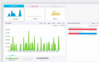
Cleaned Traffic Report