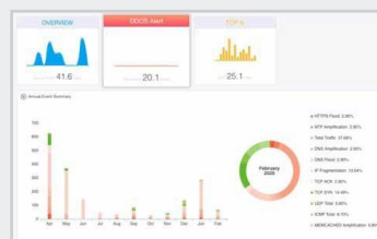
DDoS Events Details & Summary