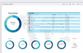
Network Status Summary